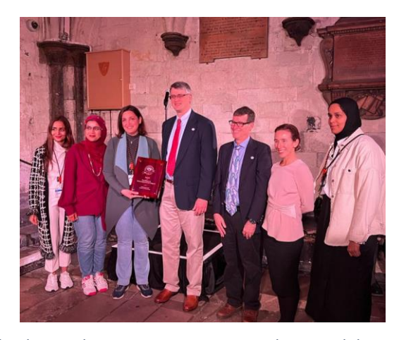
Al Adan hospital ECMO Centre receiving the award during the last EURO ELSO 2022 in London, in the historical West Minister Abbey. This was the first in-person award ceremony after the pandemic. Definitely worth the wait.

Ghala Street, Al Ghubra, Muscat, Oman – 2024